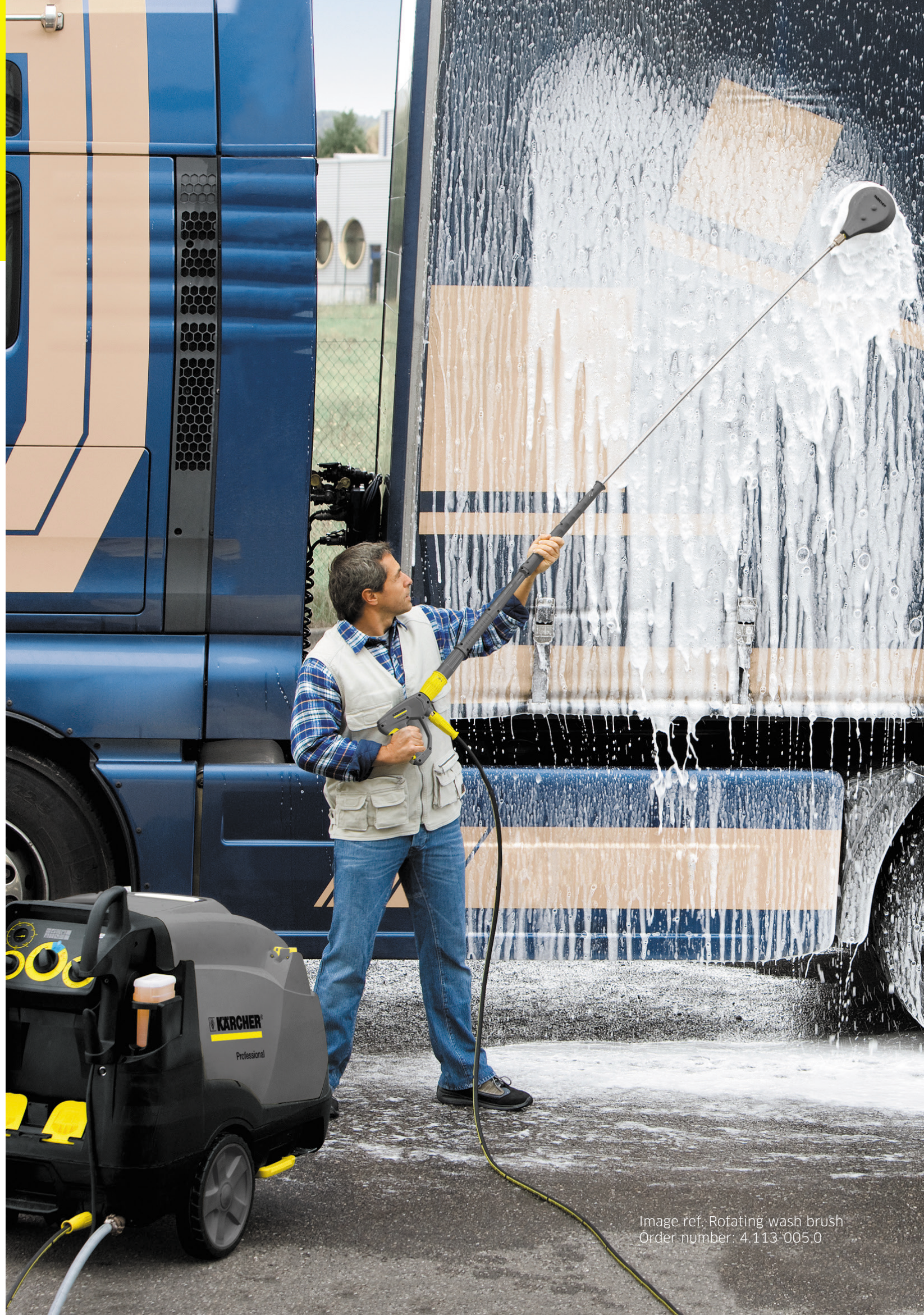
Image ref. Rotating wash brush Order number: 4.113-005.0